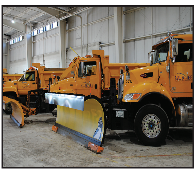
Gurnee's Snow Plow Fleet is ready for the winter season. The Village Snow Fleet includes 22 trucks on 11 routes and 4 trucks on standby

For any questions, see the full Snow & Ice Control Plan on the Village's website at www. gurnee.il.us/public_works/ street/plowing or contact the Department at (847) 599-6800.