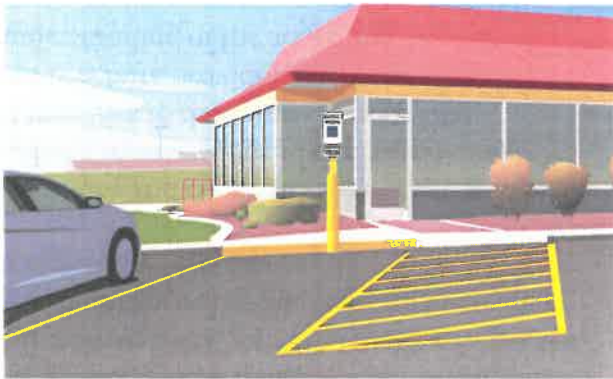
Illustration of a legal angled accessible parking space.

Any facility offering parking for employees or visitors must provide accessible parking for people with disabilities. An accessible parking space consists of a vehicle space and a diagonally striped access aisle. The entire space must be kept clear of obstructions—including ice, snow, shopping cart corrals, trash cans, seasonal garden displays and bicycle racks—at all times.