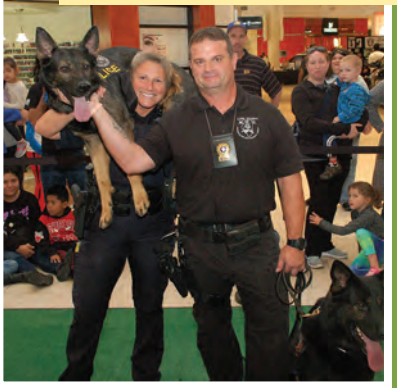
Page 15 - Law Enforcement Expo