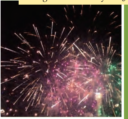
Pg. 3 - D50