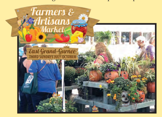
East Grand Farmers & Artisans Market

For each issue of Keeping Posted , the Village will call out one or two exceptional projects, events or employees that epitomize the Village's strategic goals of engaging the public, preserving our community and quality of life or advancing our services in response to public needs.