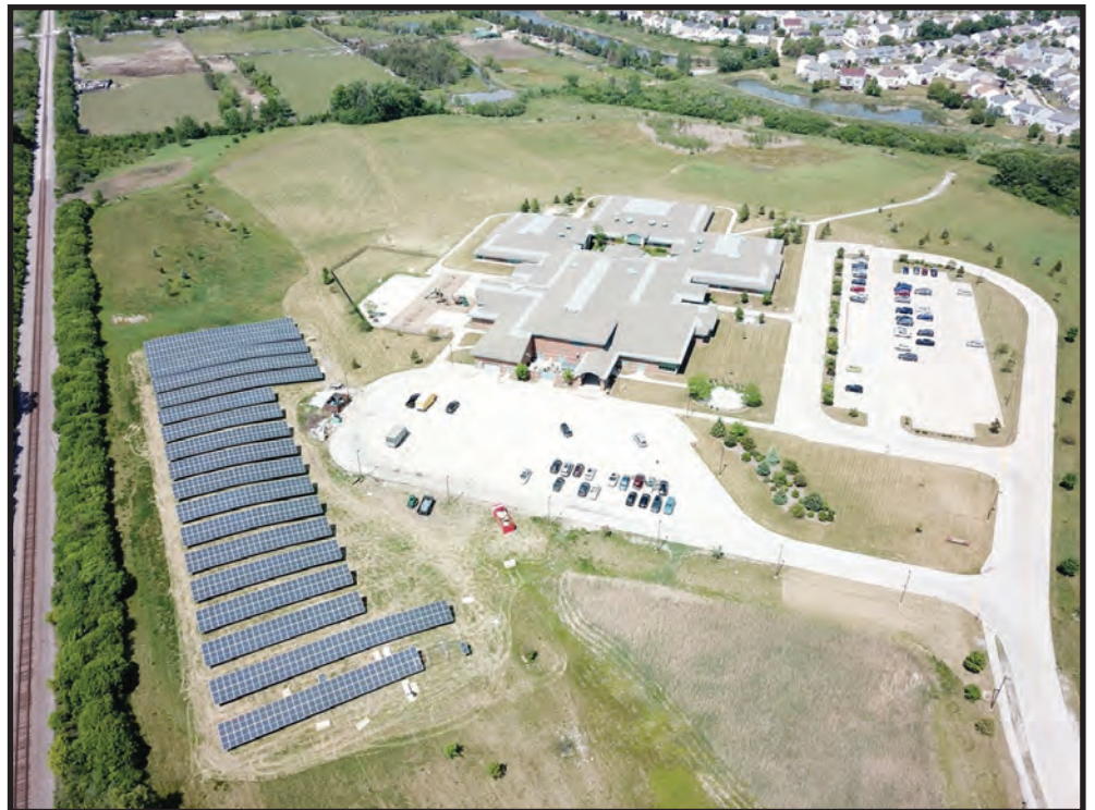
An aerial view of the new solar installation at Prairie Trail School in Wadsworth.

The new solar field has been installed on the western portion of the property and is visible for all students and visitors to learn about renewable energy through firsthand experience. A web-based user interface will be available to any interested party that tracks live energy production and environmental benefits. In addition, the District intends to work with its program provider to capitalize on learning resources that tie solar energy into the classroom for our students.