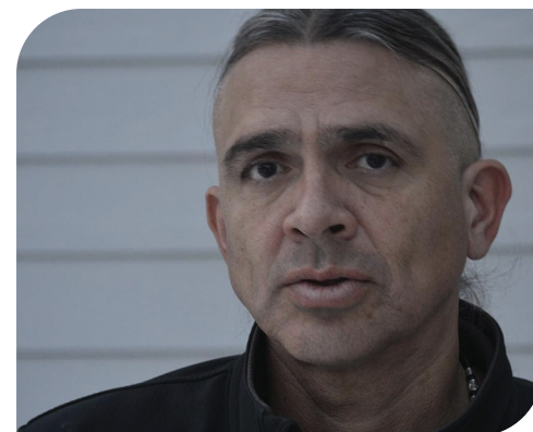
Stephen Graham Jones