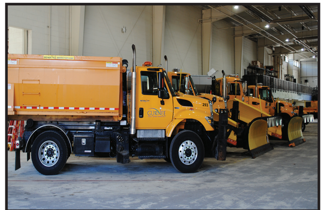
Gurnee's Snow Plow Fleet is ready for the winter season. The Village Snow Fleet includes 23 trucks on 11 routes and four trucks on standby

During and after a snow event, the Department's goal is to keep roads open and passable to the greatest extent possible. This means that while motorists will be able to travel on roads, these roads may not be completely clear of snow or ice, especially in extremely cold conditions. Again, the Department manages its resources wisely and encourages all drivers to build in extra travel time and drive safely and slow when the snow starts to fly.