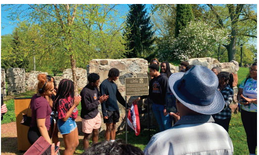
Honored First African American Gurnee Settler Amos Bennnett