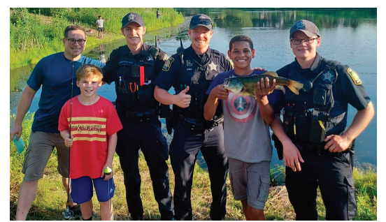
Hosted First Cops and Bobbers, Training in the Park and Open Houses