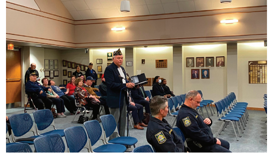
Established Veterans Commission to Better Serve Local Veterans and Their Families