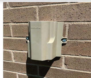
New Orion Device

During the change out, water service will not be disrupted. Employees will have Village identification, including bright yellow vests and identification badges. Staff will knock on doors prior to beginning work to keep residents informed.