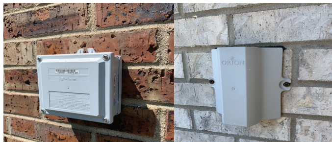
Examples of Old Orion Devices Prior to Change Out

The change out will occur over a four-year program. Almost all current Orion devices are located on the exterior of homes. Change out in those situations will not require appointments. Staff will work through a neighborhood one house at a time to remove the old Orion and install the new one. If an Orion device is located inside or if there are issues prohibiting an exterior change out, the resident will be notified by a door tag of the need to set up a time when we can enter the home.