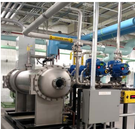
New Ozone System installed in 2017 at CLCJAWA

Our tap water quality is consistently monitored by the Village, by the Illinois Environmental Protection Agency (IEPA), in the CLCJAWA Water Quality Lab, and by other independent labs. This aggressive water quality assurance program is thorough: bacteriological tests are conducted six times more often than required, water clarity is monitored every 10 seconds, and our water is checked for hundreds of contaminants annually.