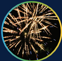
SATURDAY FIREWORKS 9:00-9:30PM