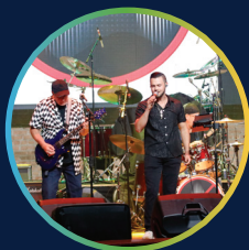
SATURDAY NO LIMIT 5:15-7:15PM