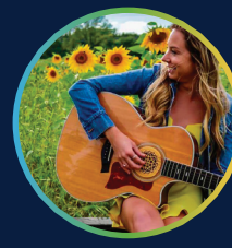
SUNDAY SPARKS FLY TAYLOR SWIFT TRIBUTE BAND 1:30-3:00PM