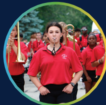
SUNDAY PARADE 12:00-1:00PM