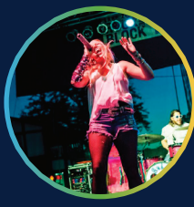
SATURDAY HELLO WEEKEND 8:00-9:00PM 9:30-10:30PM